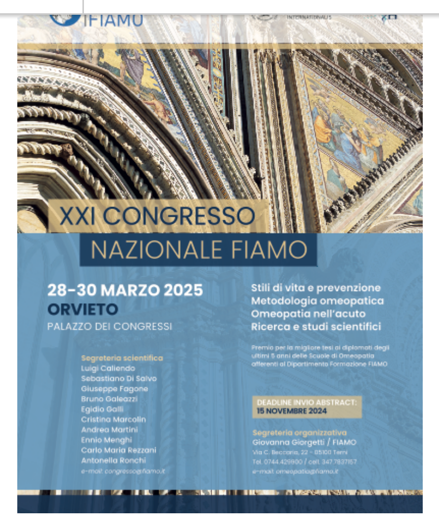
Find out more